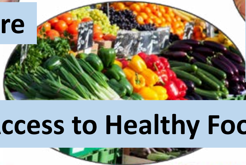
Access to Healthy Food