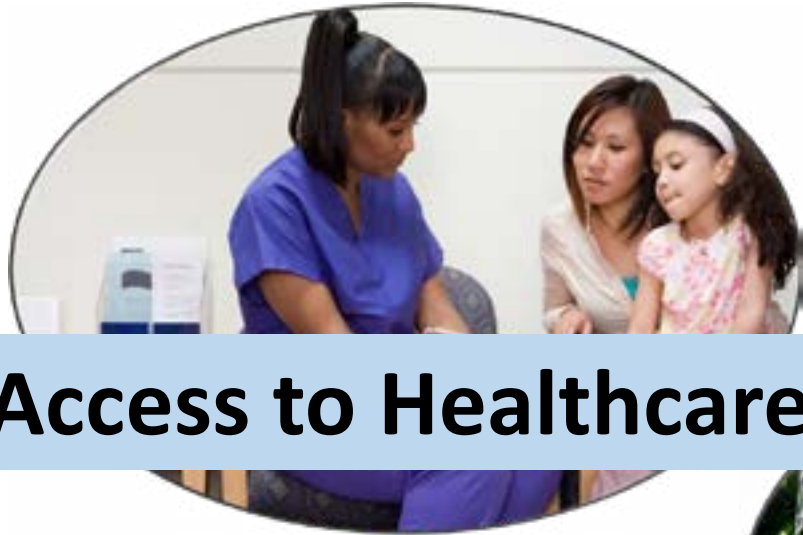
Access to Healthcare