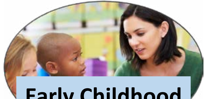
Early Childhood Development